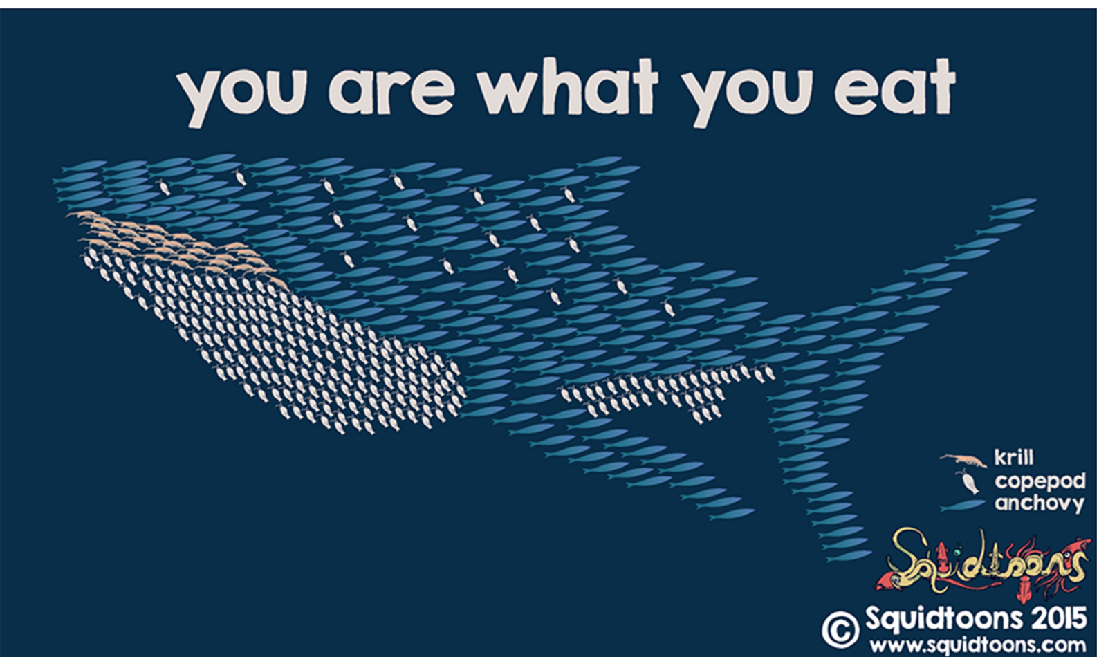
Fig. 2. Cartoon demonstrating the simple concept of trophic ecology.