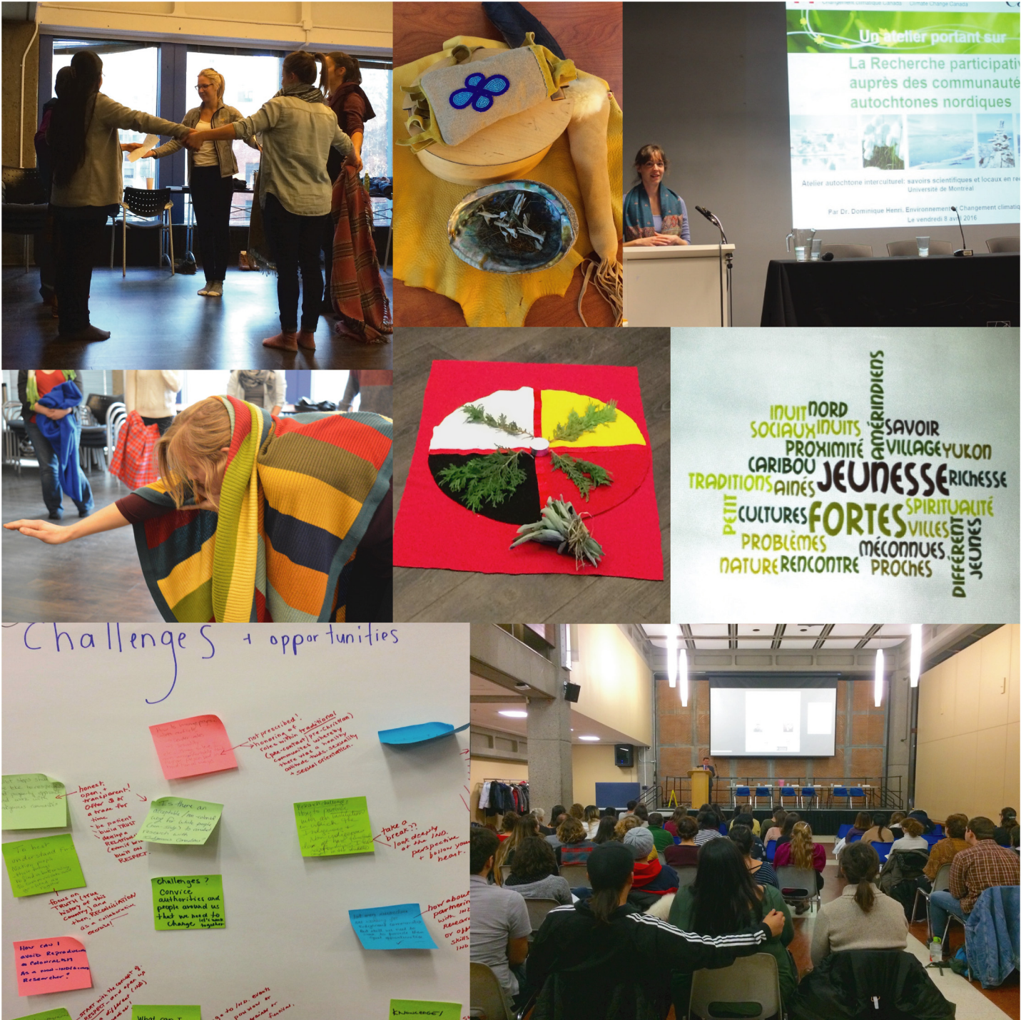
Fig. 2. Photo mosaic showing the physical environments of the Intercultural Indigenous Workshops, as well as examples of the interactive activities.