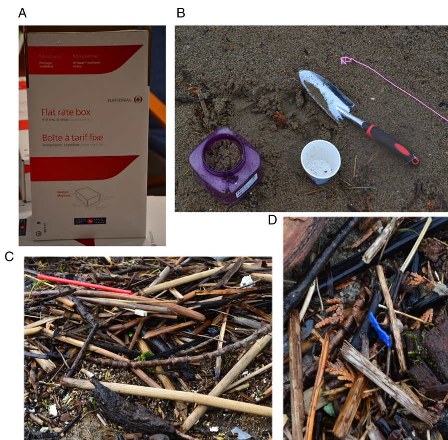
Fig. 2. (A) Pre-paid postage box used by Community Scientists to return samples. (B) A container, trowel, paper cup, and string used for collection by the citizen scientists. (C) and (D) Pictures of debris layers after a spring flooding.

Additional analysis included exploring significance between urban and non-urban area concentrations, comparing lake areas to higher flow sections of the river, and comparing between the main channel and tributaries. Various t-tests were performed to establish any significance between these variables.