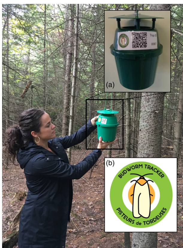
Fig. 2. A volunteer checking one of the Budworm Tracker traps that has been suspended from a lower crown branch of a host tree. (a) A close-up view of the trap and the label with its unique QR code, a Trap ID number, and (b) the Budworm Tracker logo (bilingual English/French).

We provided BTP start-up kits free-of-charge to volunteers. Kits consisted of the following components: supply checklist and set-up instructions, pheromone trap (Unitrap, Contech Enterprises Inc., pre-assembled with a unique identity number; Fig. 2a), a budworm pheromone lure, an insecticidal strip, pre-labeled paper bags (40), a freezer bag, one pair of gloves, a wooden stick for sweeping moths into bags, a pencil or pen, a data collection sheet, a contact information sheet, and a prepaid and addressed return envelope (Fig. S1). In 2018, the insecticidal strip was switched for a solution of soapy water, which provided a simpler and cleaner way to kill moths in traps. Each year, volunteers who wished to continue with the program were encouraged to keep and store their trap, and they were shipped a small refill kit with the same components except the pheromone trap, which was sent at a reduced shipping cost. Kits were sent in a box large enough to enclose all its components (for our full