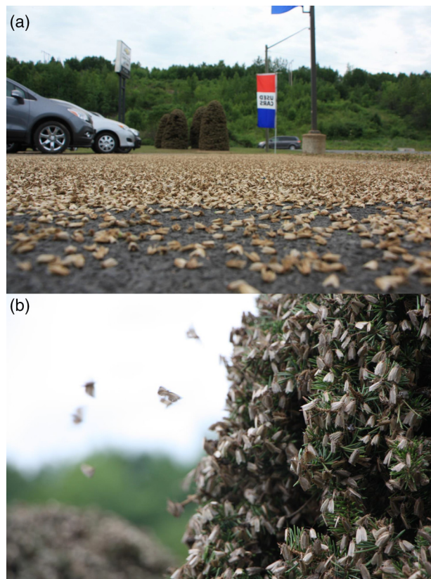
Fig. 1. (a) Spruce budworm moths carpeting a parking lot in the aftermath of a mass exodus flight in Campbellton, New Brunswick, Canada. (b) A tree near the same parking lot covered in spruce budworm moths.

In this article, we outline the BTP, including the project design, volunteer recruitment and retention approaches, data validation procedures, as well as some of the core scientific questions it was designed to address. The BTP involves outsourcing pheromone trap data collection to volunteers living throughout the eastern outbreak range of budworm. Volunteers receive in the mail pheromone-baited traps, collection accessories, and detailed instructions on how to use the traps to capture and store moths. Aside from providing an inexpensive means of deploying traps, the BTP provides unique data on the relative timing of moth flight throughout the region, which can reveal deeper ecological insights into the range, destinations, phenology, and intensity of moth dispersal throughout the region (Pureswaran et al. 2017). Since its inception in 2015, the program has expanded to all six eastern Canadian provinces (from Ontario east) and Maine, United States. We also evaluate the efficacy of the BTP using results from the first three years (2015–2017) and briefly discuss its contributions to pest management and ecological research using the 2016 trapping season as an example.