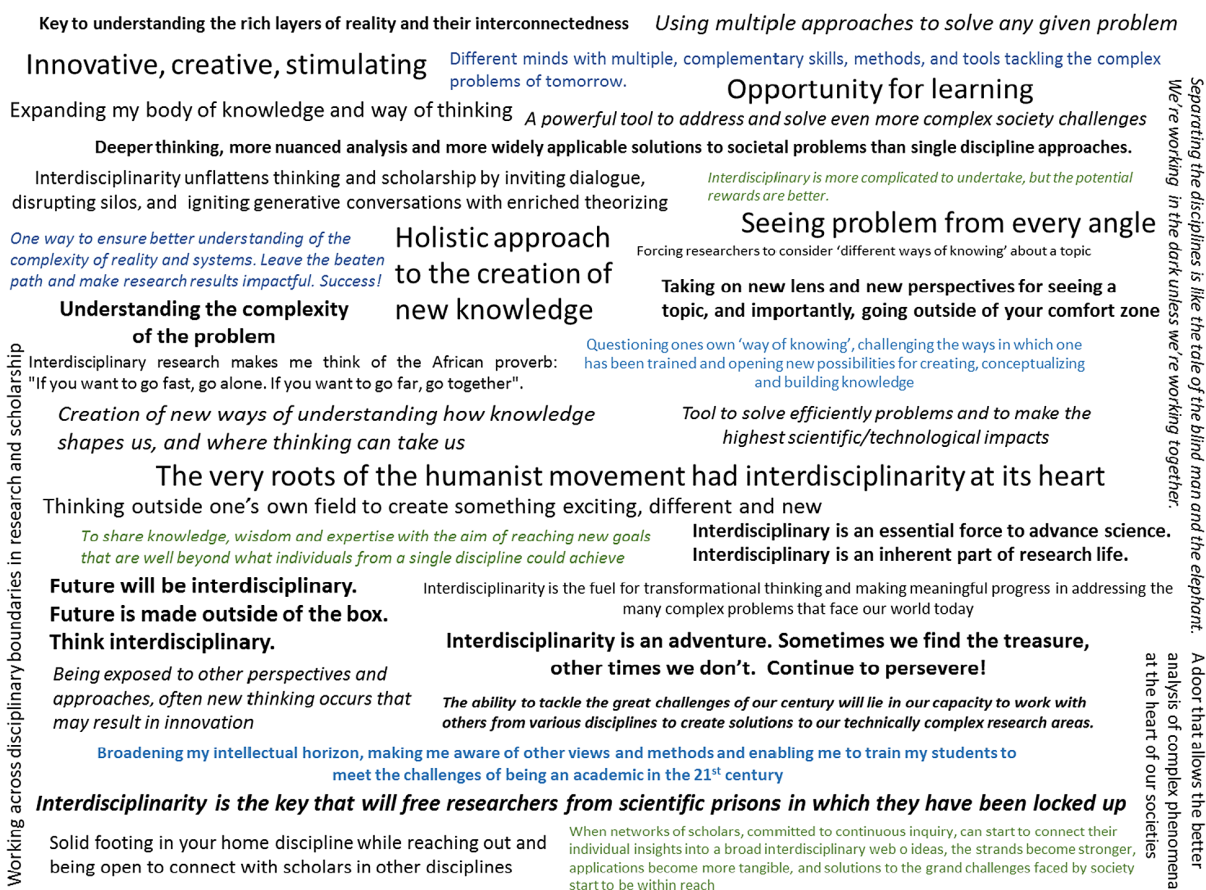
Fig. 7. Quotes from authors describing what interdisciplinarity means to them.