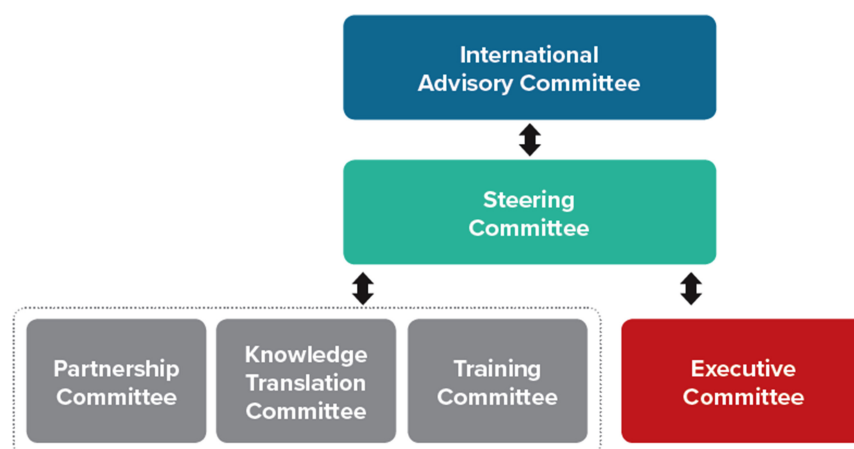
Fig. 1. Governance structure.

The principal investigators established a governance structure that would fulfill the CIHR mandate based on a "results-based" model, which employs a small number of committees structured around overall governance, rather than day-to-day management and operational functions (e.g., finance, human resources, programming) ( O'Flynn and Wanna 2008 ). The SPOR Evidence Alliance's six results-based standing committees include the International Advisory Committee, Steering Committee, Executive Committee, Knowledge Translation Committee, Partnerships Committee, and the Training and Capacity Development Committee ( Fig. 1 ).